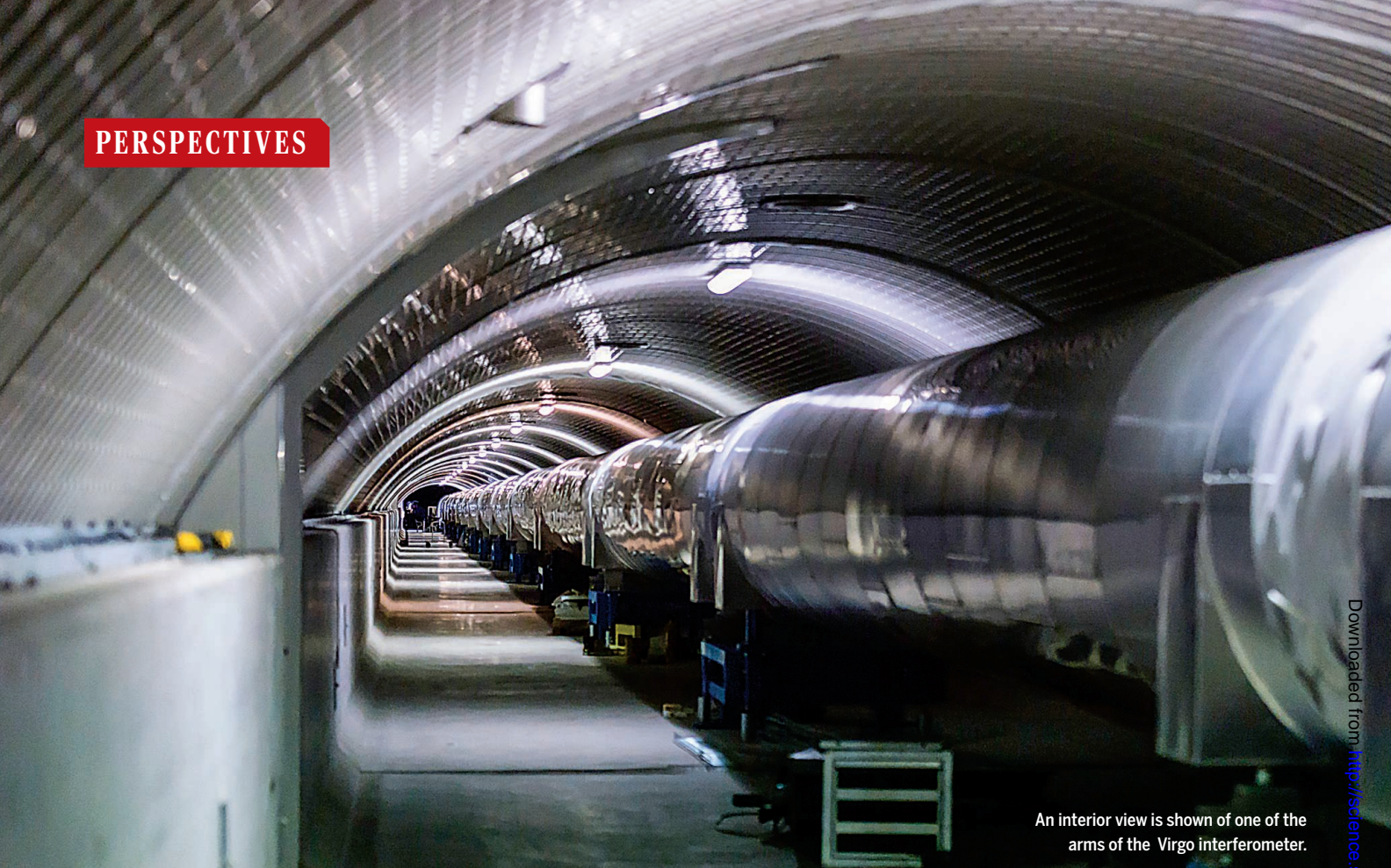
An interior view is shown of one of the arms of the Virgo interferometer.