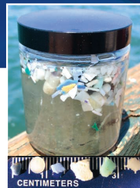
Catch of the day.

Plastic bits in the ocean (top) and collected from plankton tows in the Great Pacific Garbage Patch.